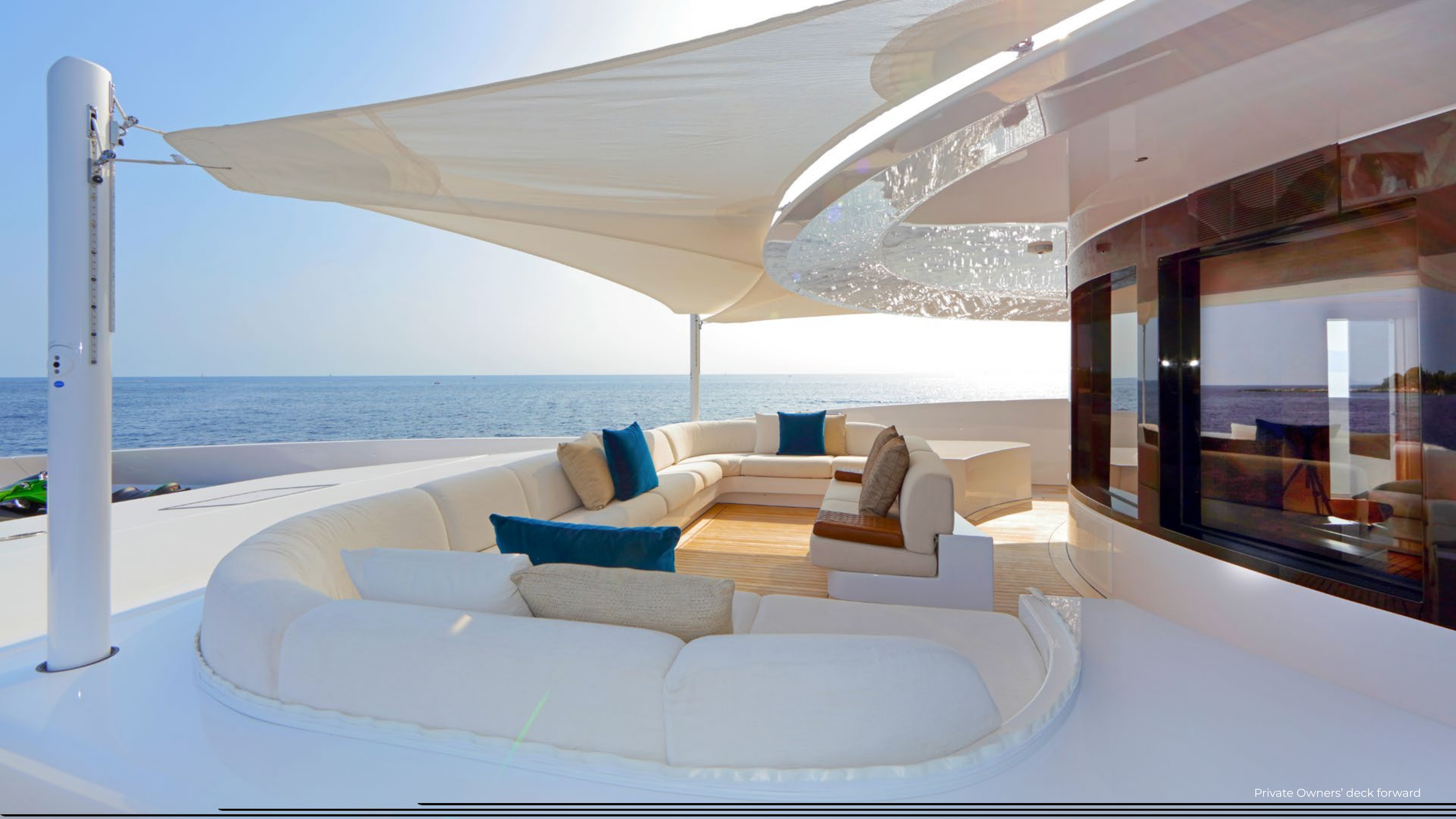
Private Owners' deck forward