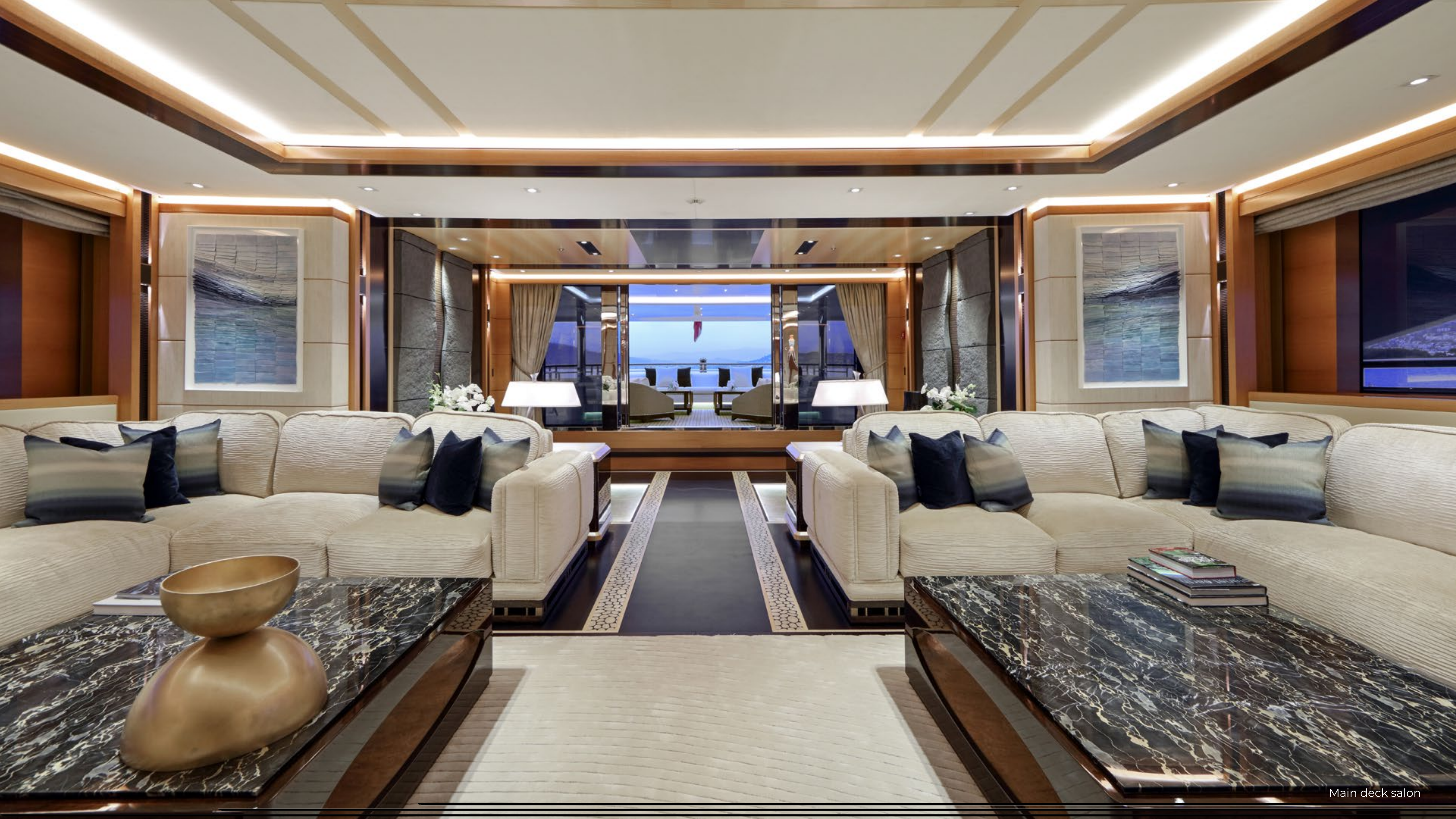
Main deck salon