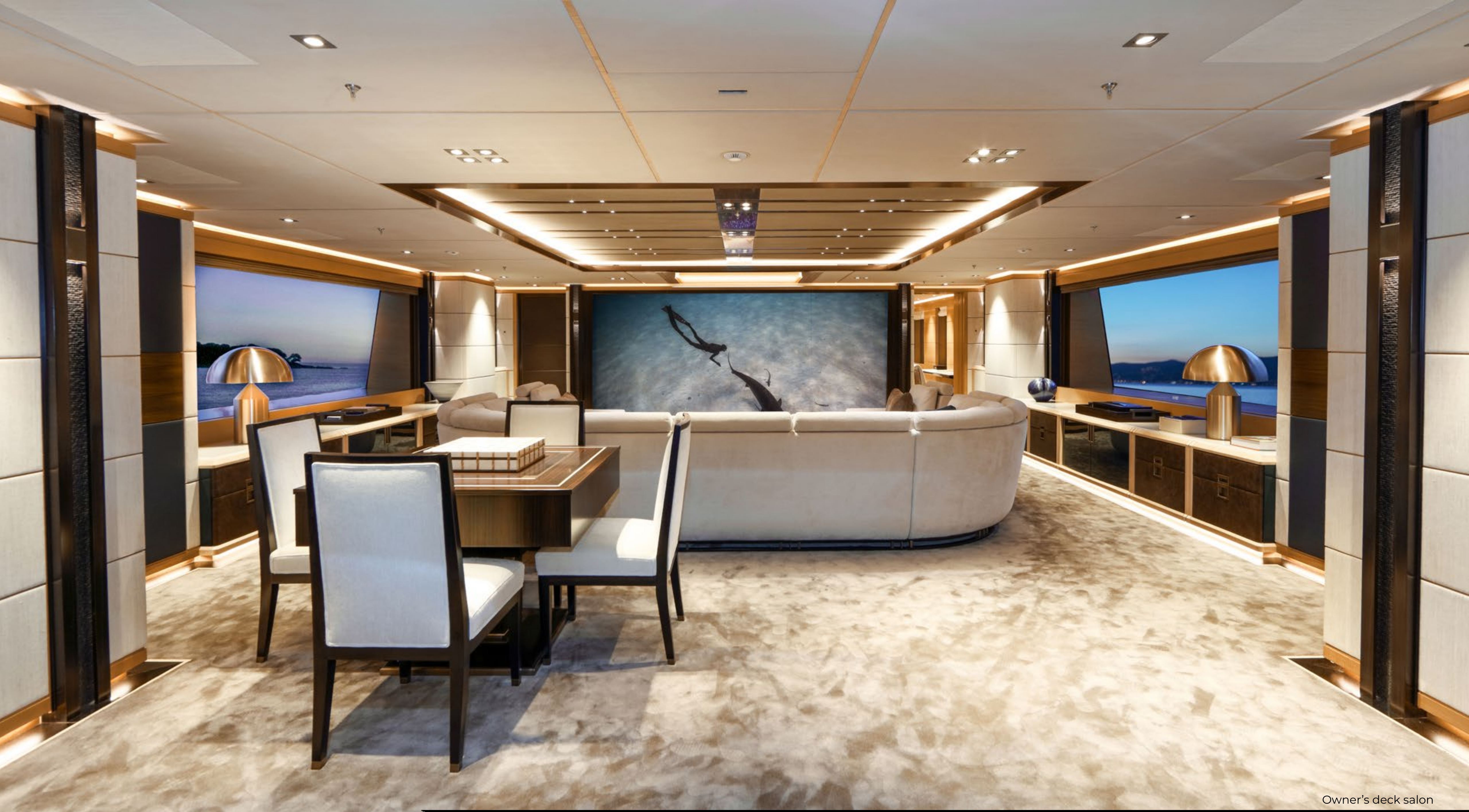
Owner's deck salon