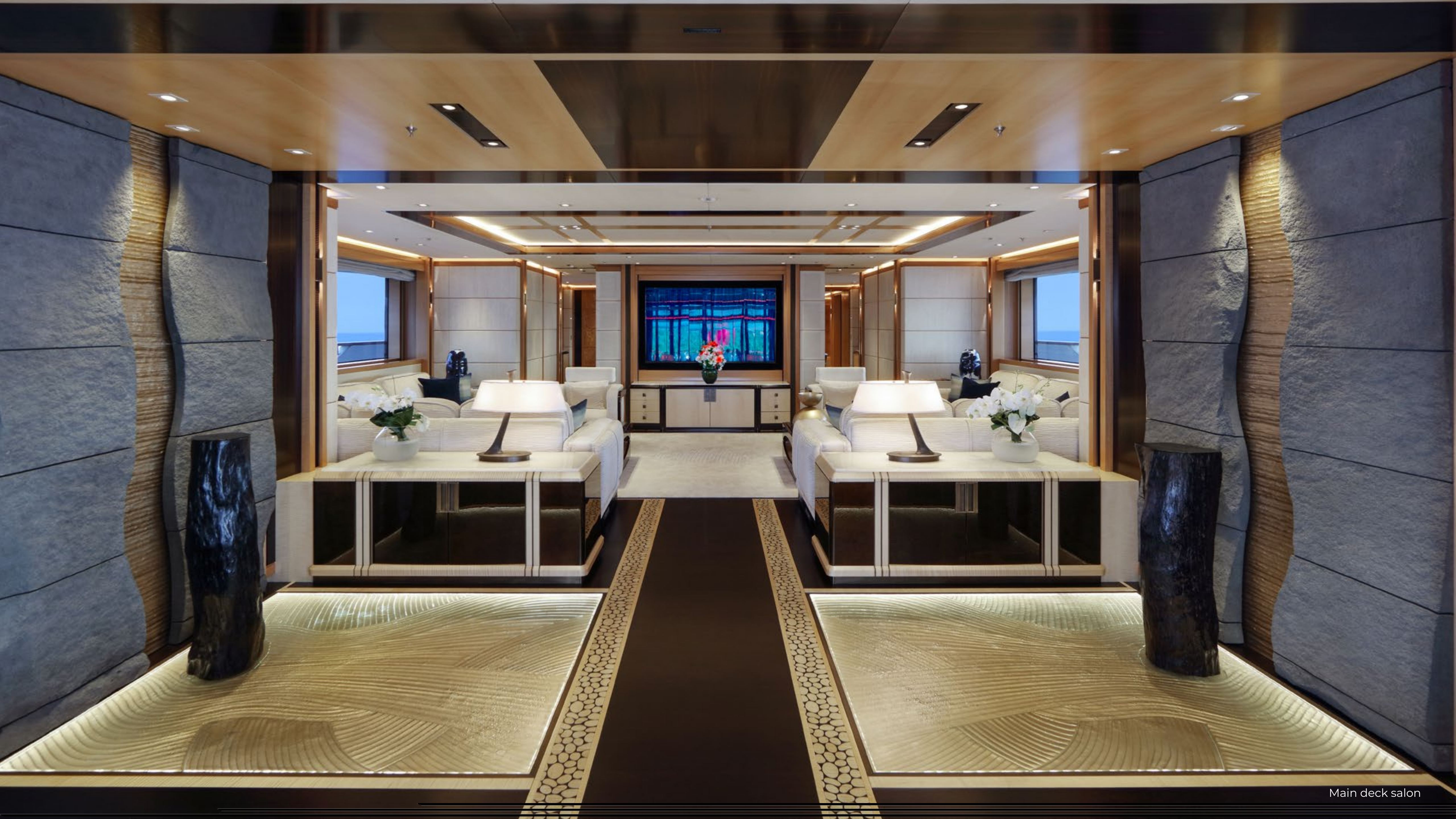
Main deck salon