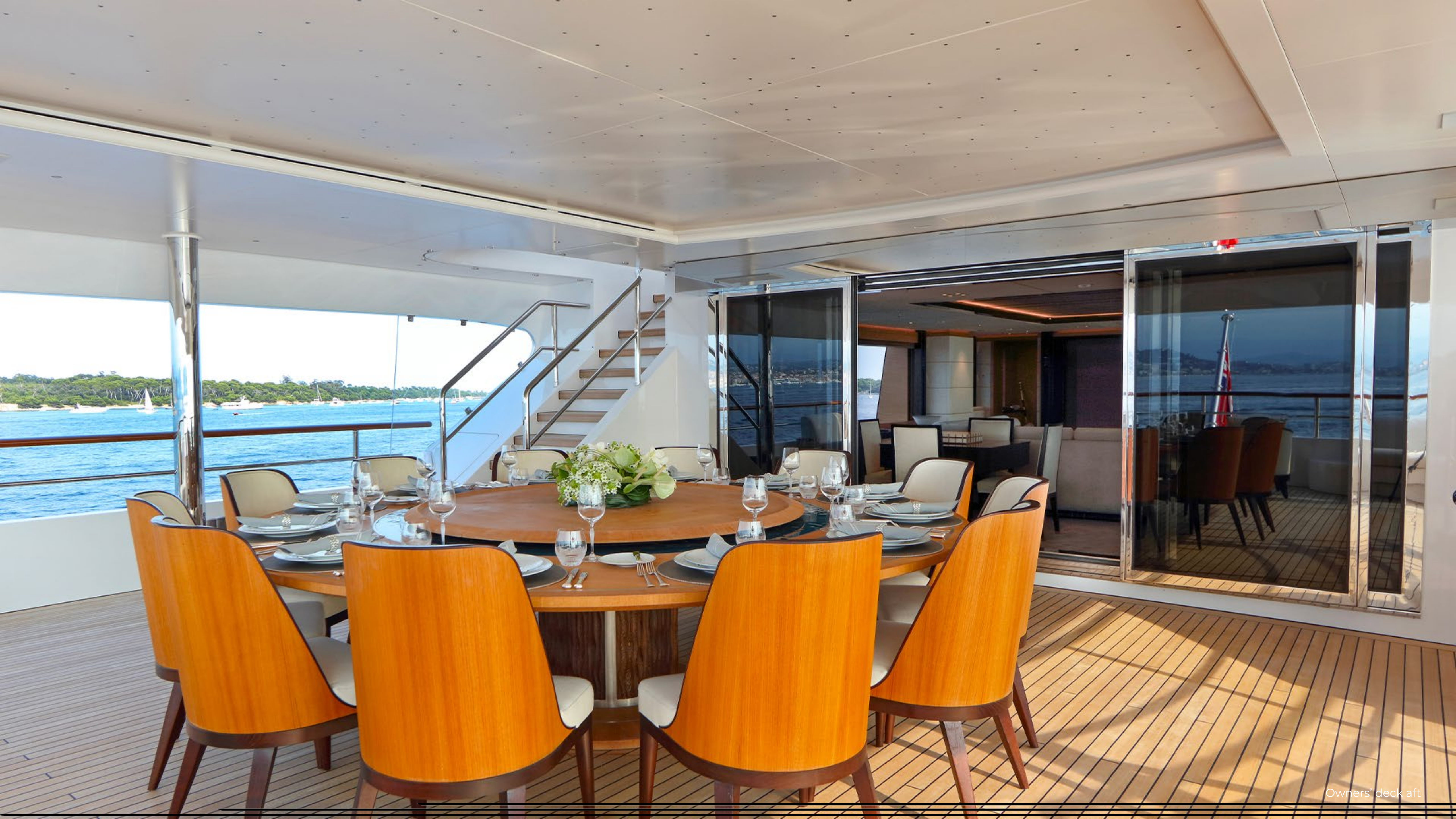
Owners' deck aft