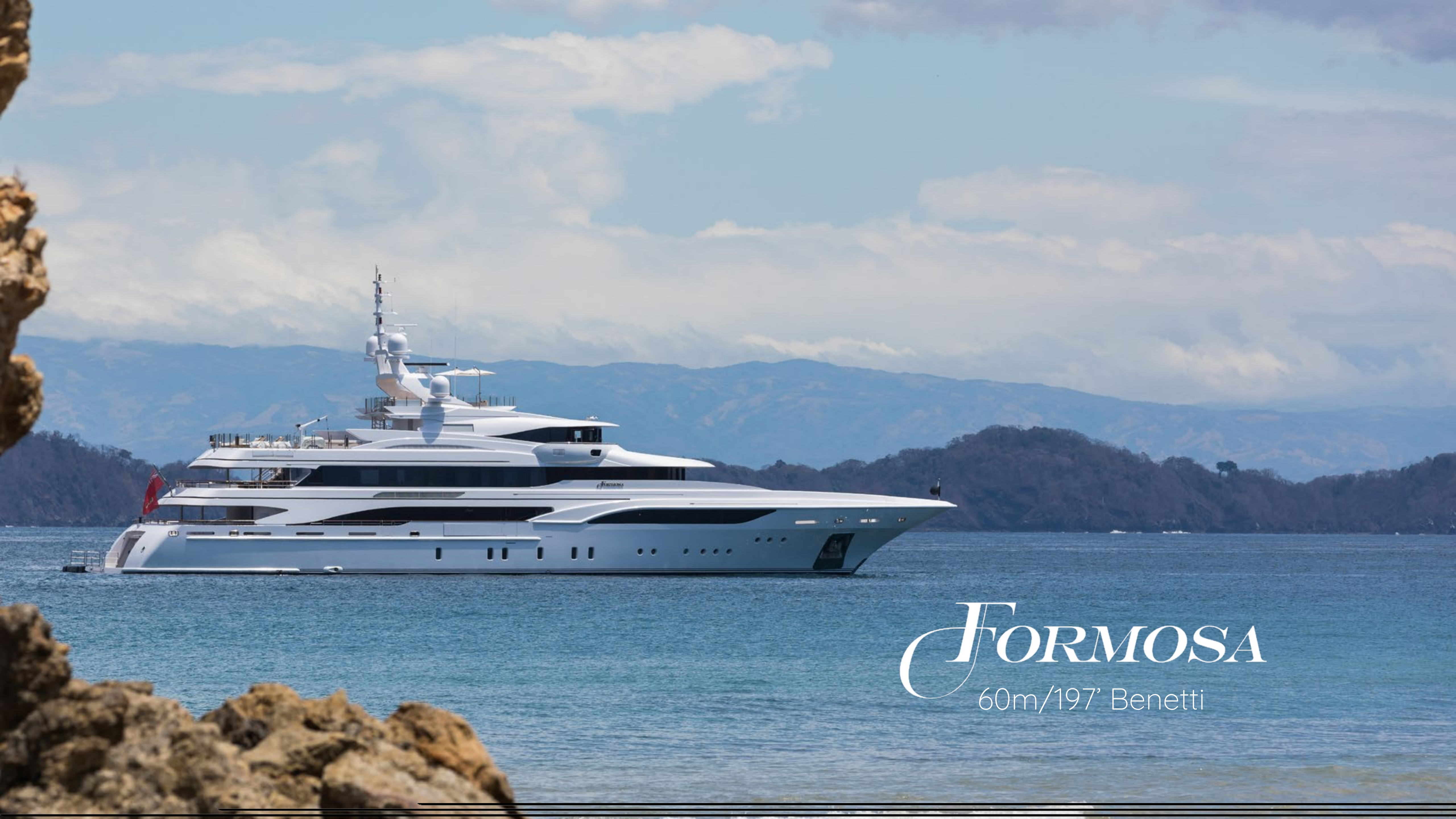
FORMOSA 60m/197' Benetti