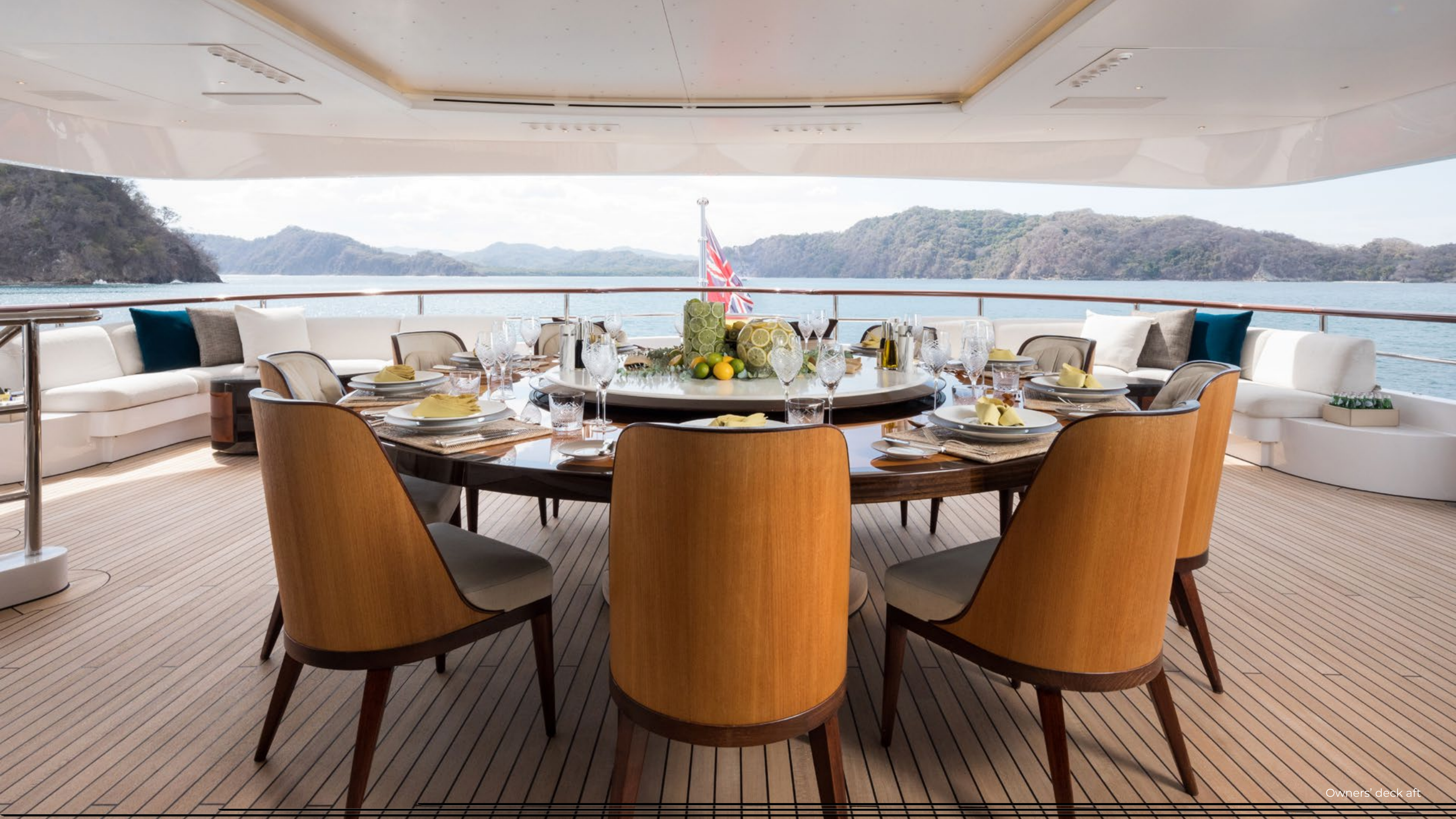
Owners' deck aft